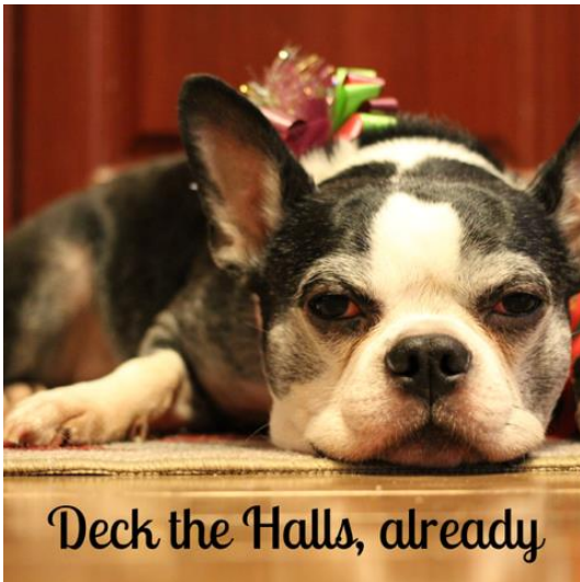
Deck the Halls, already