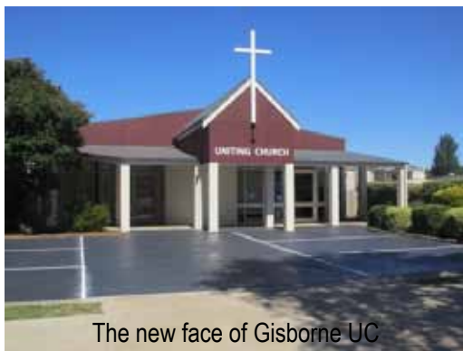
The new face of Gisborne UC