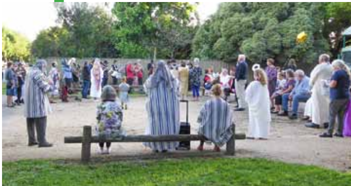
'Follow the Star' participants stop in the Lions Park, Romsey, to sing a carol. About 100 people, many in costume, were involved on Thursday evening 21st December.

Romsey Congregation's Community Street Christmas Tree located in the main street with the trees from the Historical Society and Candlebark School.