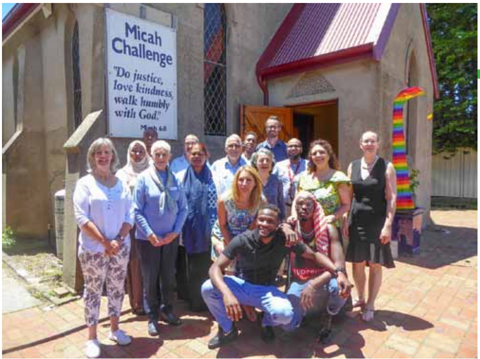
Community lunch on Sunday, 10th December 2017, with members from the Partnership and representatives from Victoria's Muslim Community to start a conversation about a community hub and multi-faith space at the Woodend Church.